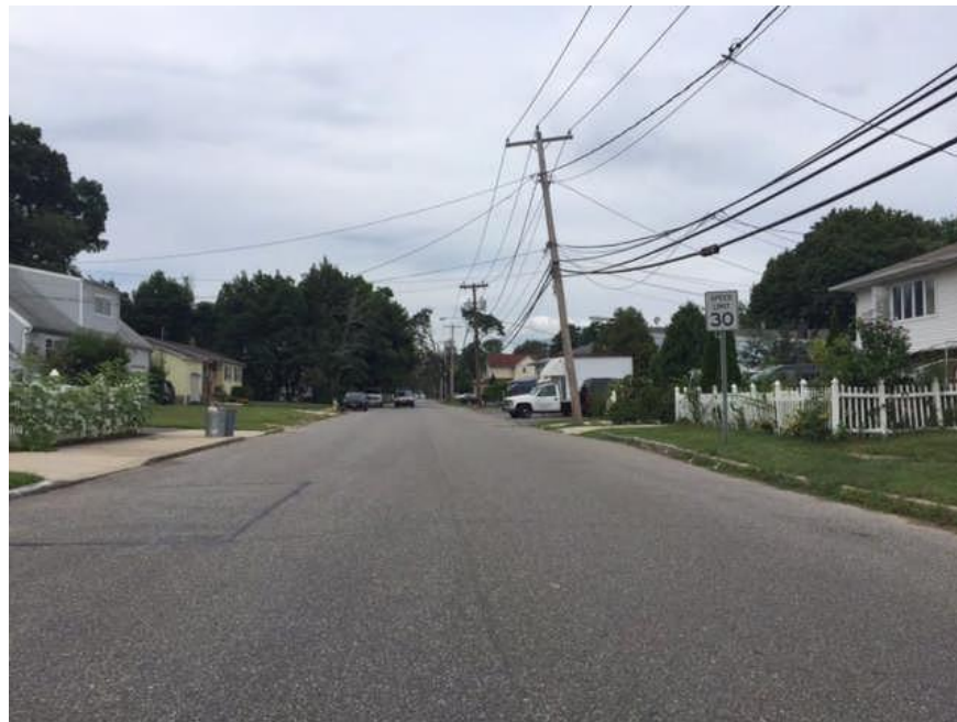
Street view along N. 8 th St. (Subject on the Right)

The site is connected to the municipal sewer system. Condition of the plumbing system within the building is unknown.