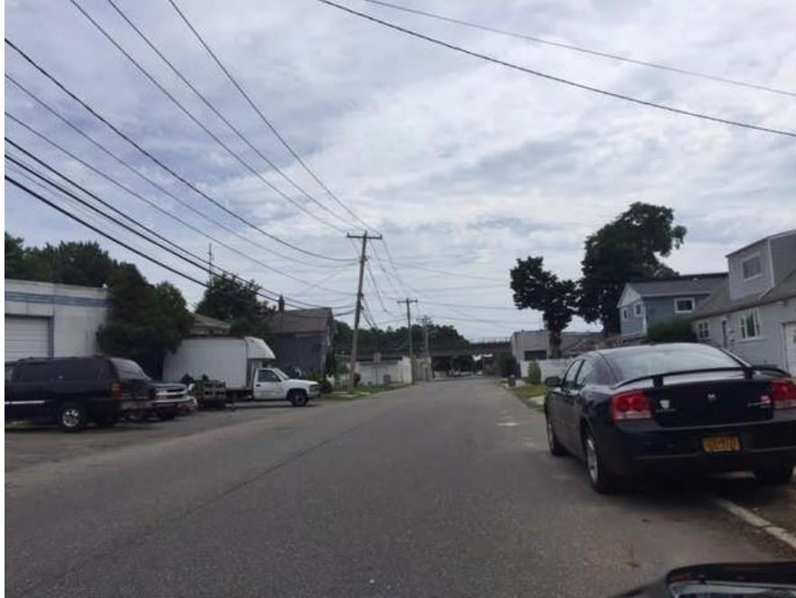
Street view along N. 8 th St. (Subject on the Left)